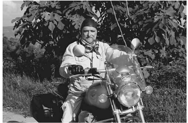
Fig. 15 ...on the bike