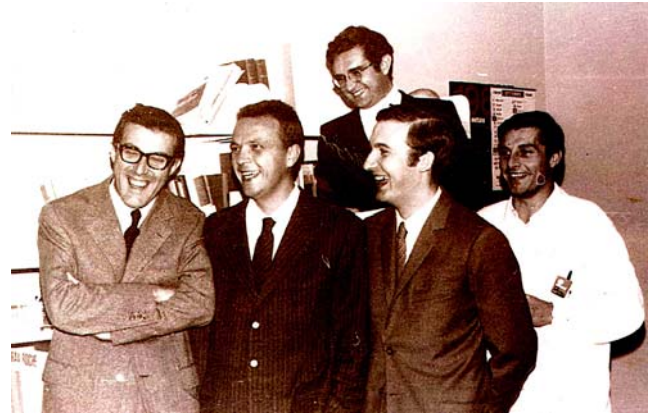
Fig. 3 Department of Neurosurgery, Verona, 1968: neurosurgical staff