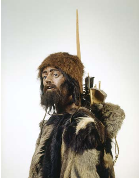
Fig. 14 Oetzi, the Similaun Man