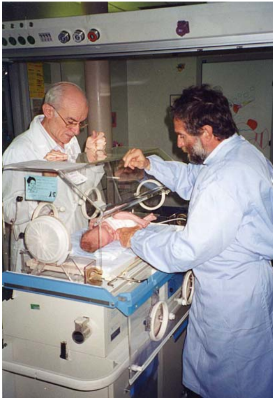
Fig. 5 Pediatric Intensive Care Unit